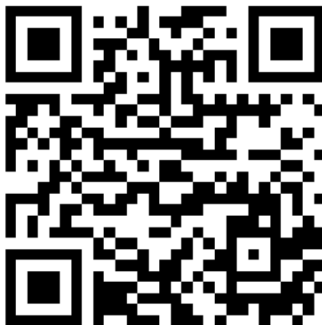
Noise Exposure Android